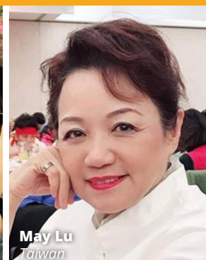
May Lu Taiwan

FIVE CONTINENTS/COUNTRIES ■ FIVE LIVES WITH ROTARY ■ FIVE STORIES